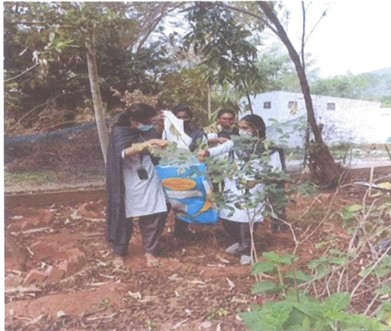
Vignan Institute of Pharmaceutical Technology Latitude:17.711765, Longitude:83.164114 Visakhapatnam