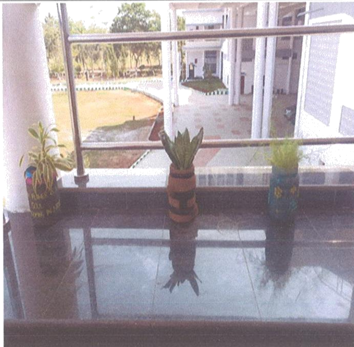
Vignan Institute of Pharmaceutical Technology Latitude:17.711765, Longitude:83.164114 Visakhapatnam