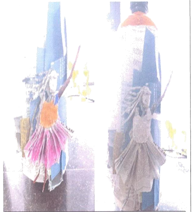
Vignan Institute of Pharmaceutical Technology Latitude:17.711765, Longitude:83.164114 Visakhapatnam