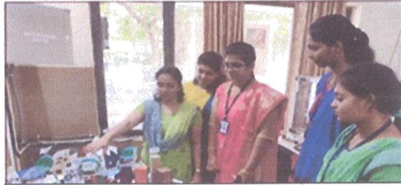
Vignan Institute of Pharmaceutical Technology