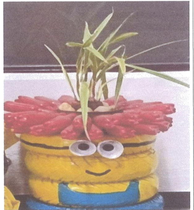
Vignan Institute of Pharmaceutical Technology